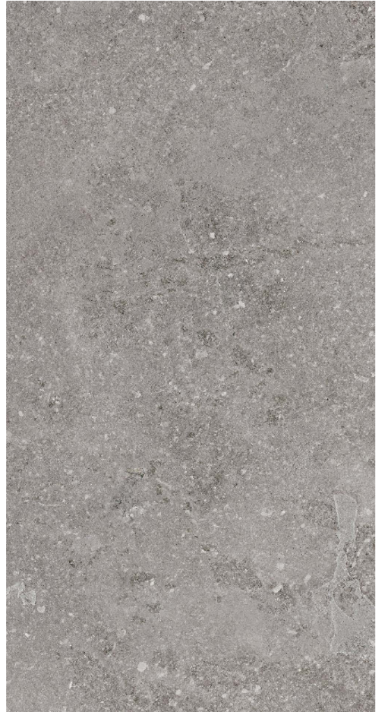
NATURE Matte Finish

60 x 120 cm (24" x 48") Thickness: 9 mm AV.BS.WHT.2448.MT