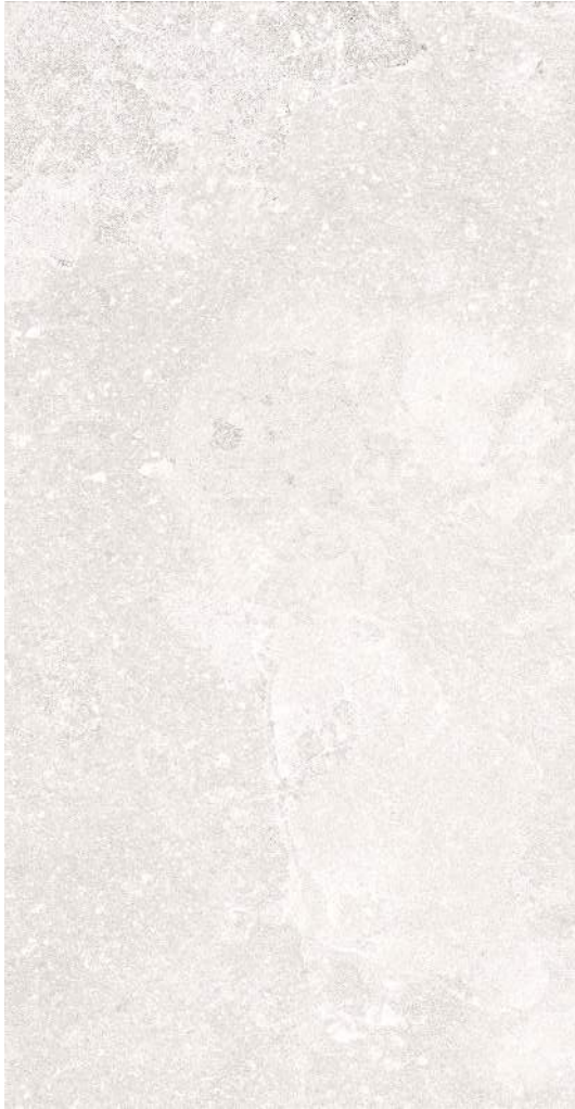
WHITE Matte Finish

30 x 60 cm (12" x 24") Thickness: 8.5 mm AV.BS.WHT.1224.MT