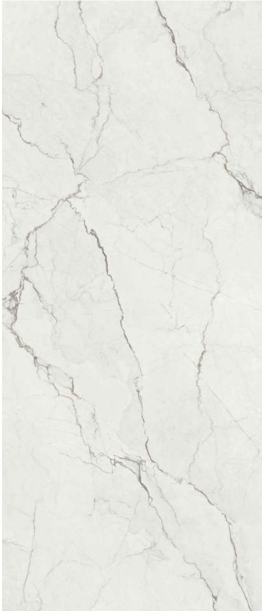
QUARTZITE LUNA Semi-Polished Finish

119.4 x 280 cm (47" x 110.24") Thickness: 6mm IB.SU.QLU.48x110.SP