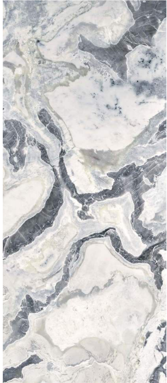
DOVER WHITE Semi-Polished Finish

119.4 x 280 cm (47" x 110.24") Thickness: 6mm IB.SU.QLU.48x110.SP