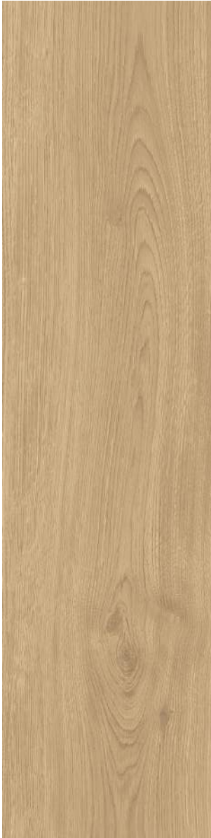
SUGAR (Light Beige) 22.5 x 90 cm (9" x 36") Matte Finish Nominal Thickness 8 mm WA.WD.SGR.0936.MT