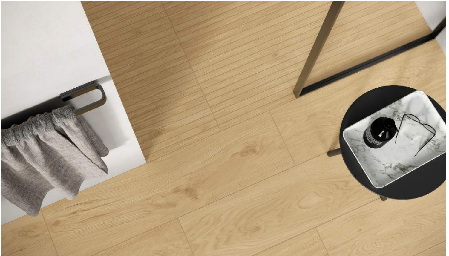
SUGAR (Light Brown)