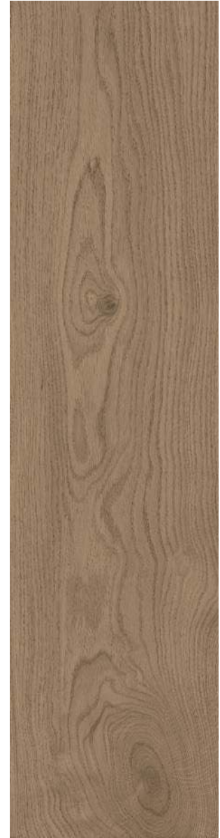
TAMARIND (Brown) 22.5 x 90 cm (9" x 36") Matte Finish Nominal Thickness 8 mm WA.WD.TMD.0936.MT

All items shown in this document are part of Olympia's stocking program. For special orders, please contact your Olympia Tile Sales Representative.