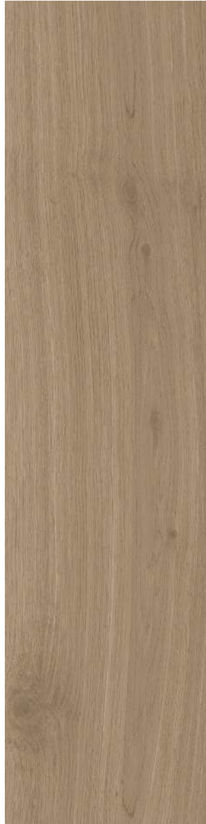
CAMEL (Beige) 22.5 x 90 cm (9" x 36") Matte Finish Nominal Thickness 8 mm WA.WD.CML.0936.MT